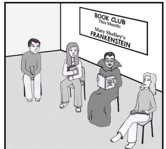
"I'd just like to go on the record to say that I am personally insulted by this month's pick for our book club."