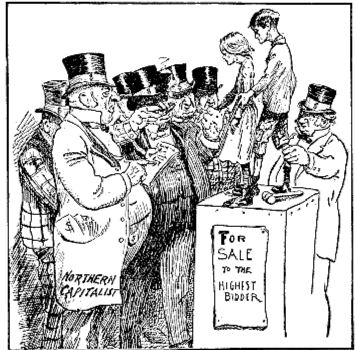
This political cartoon from 1902 is referring to child labor. The use of children as low-wage workers was common in the factories.