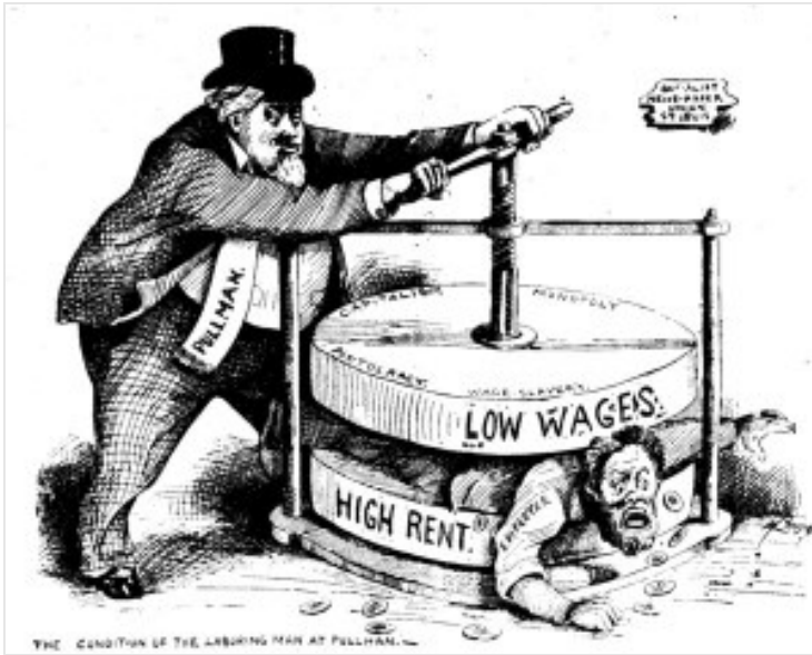
This political cartoon from 1894 was inspired by the Pullman Railroad Strike (a key event that led to the creation of Labor Day). The worker is being squeezed between low wages and high rents by his "fat-cat" employer.

Labor Day began in the late 1800s largely because there was a feeling among the general public that the common laborer was being ignored—or even abused. These political cartoons illustrate some of the feelings of the time: