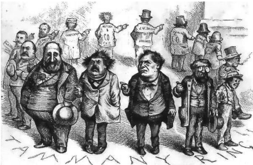
This cartoon from the 1870s asks the question, "Who stole the people's money?," and then shows several wealthy business men pointing to the "other guy." It is a statement about the rich getting richer and the poor getting poorer.