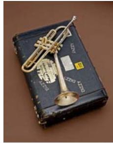
Trumpet used by Jazz sensation Dizzy Gillespie