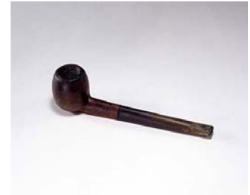
Favorite pipe of renowned Physicist Albert Einstein