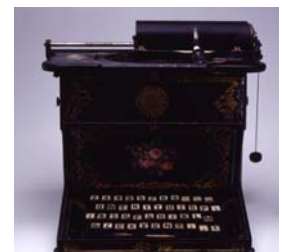
The first commercially successful typewriter