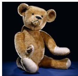
One of the first "Teddy Bears", a toy named in honor of Theodore Roosevelt