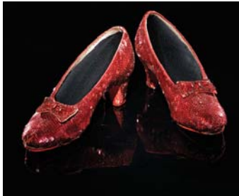
Dorothy's slippers from the Wizard of Oz