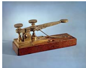
Part of the first telegraph line built in the 1840s