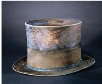
Top hat worn by Abraham Lincoln on the night of his assassination