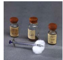
Polio vaccine created by Jonas Salk