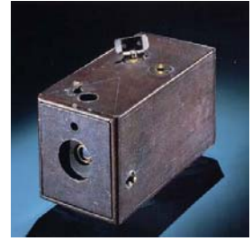
The first camera model produced by Kodak