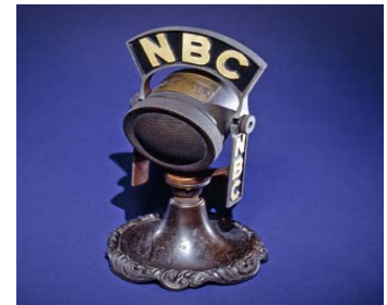
Microphone used by President Franklin D. Roosevelt to address the nation over the radio