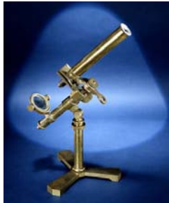
One of the first high-powered microscopes from the 1830s