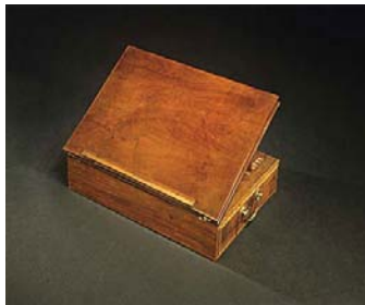
Writing box where Thomas Jefferson drafted the Declaration of Independence