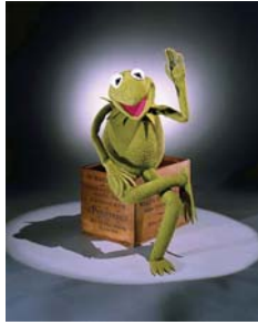
A Kermit the Frog puppet used by creator Jim Henson