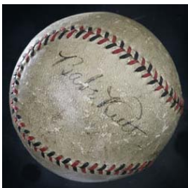
Baseball signed by the legendary Babe Ruth following one of his games