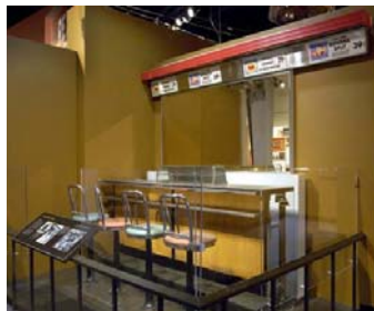
Diner counter in North Carolina where a major protest over segregation began in the 1960s