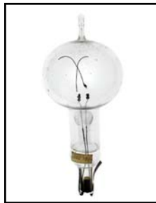
Thomas Edison's first incandescent light bulb