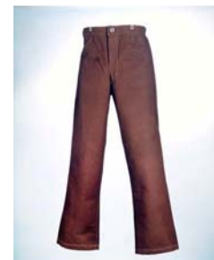
One of the first pairs of Levi Jeans from the 1870s